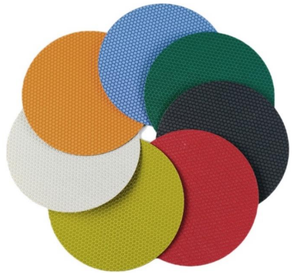
Grinding to Final Polishing